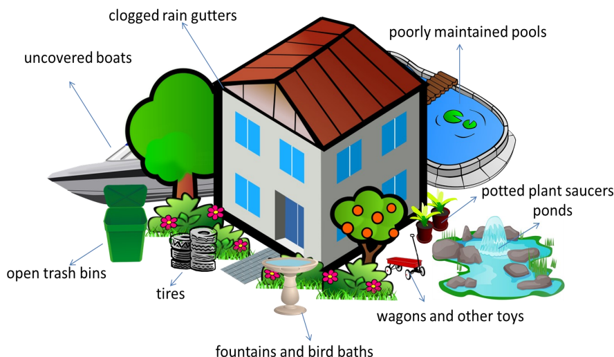
Figure 2. Common backyard mosquito sources.