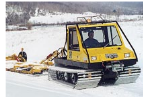
Grooming snowmobile trails

The people of Little Valley value their village, and they want to enhance the village's vitality. Municipal and business leaders are taking steps to build upon the village's assets to insure a bright tomorrow, and are looking for people to put their time, talent and investment into Little Valley today to help realize a vision for a better tomorrow.