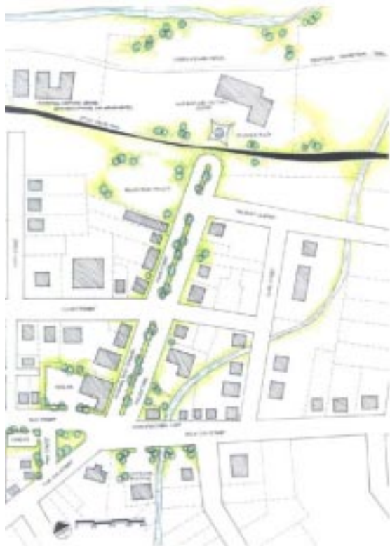
Little Valley Main Street Vision by Randall Arendt – Rendering by Lynette Markofski

Little Valley has a lot to offer right now. But we also have a dynamic vision of a future that not only maintains the village warmth and character we value, but also brings a new vitality to Main Street and builds upon new assets that cater to the equestrian community.